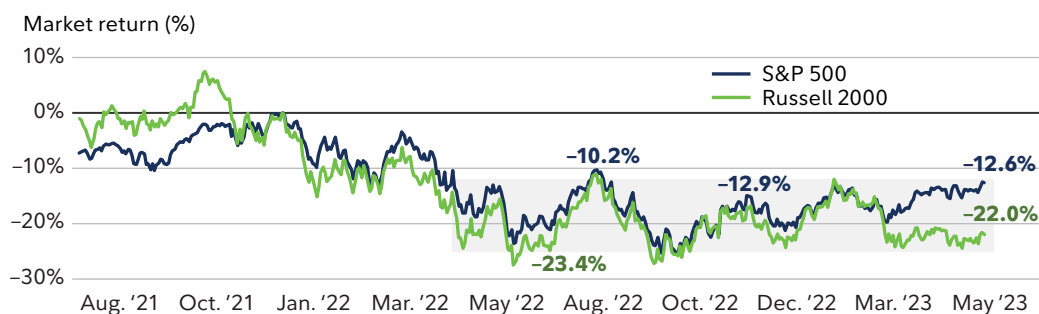
EXHIBIT 1: The market has spent a year in limbo

The stock market has been essentially directionless since June of last year. That's a long time to be in limbo, and it makes me wonder whether the strength in the S&P 500® in recent weeks could indicate that the next (or current) bull market is finally declaring itself.